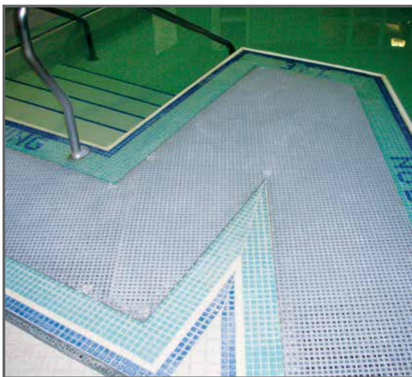
Fibergate's Micro-Mesh® molded grating, found in this public pool, required detailed fabrication due to the curves and angles of the pool's design.