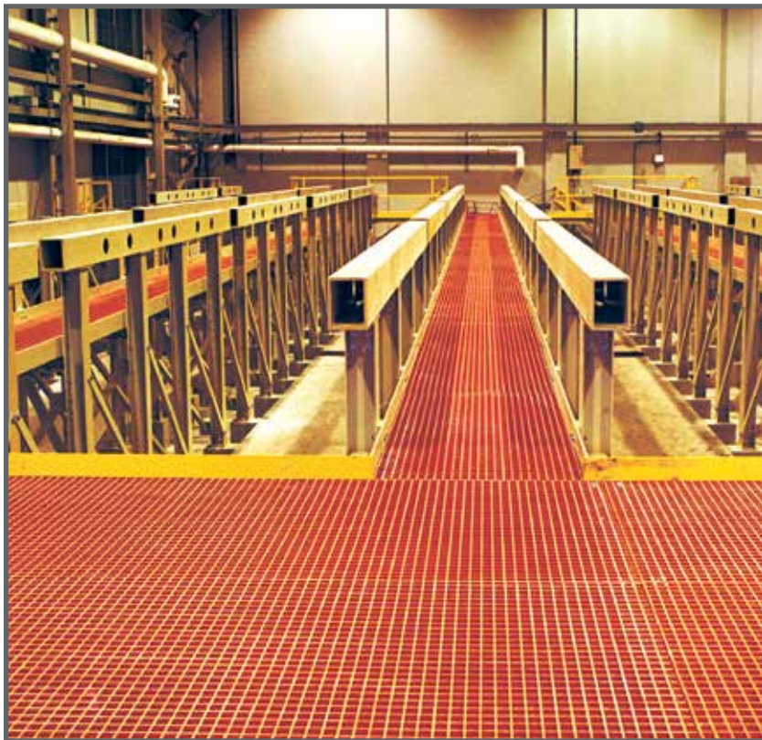
This battery plating facility's demanding corrosive environment required FRP elevated walkways, fabricated from Dynaform® vinyl ester structural shapes and Vi-Corr® molded grating.