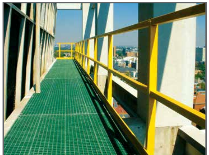
This all FRP structural system/platform uses Fibergate® molded grating, Dynarail® railings and ladder, and Dynaform® structural components. This engineered solution provides safe walkways for accessing cooling towers.