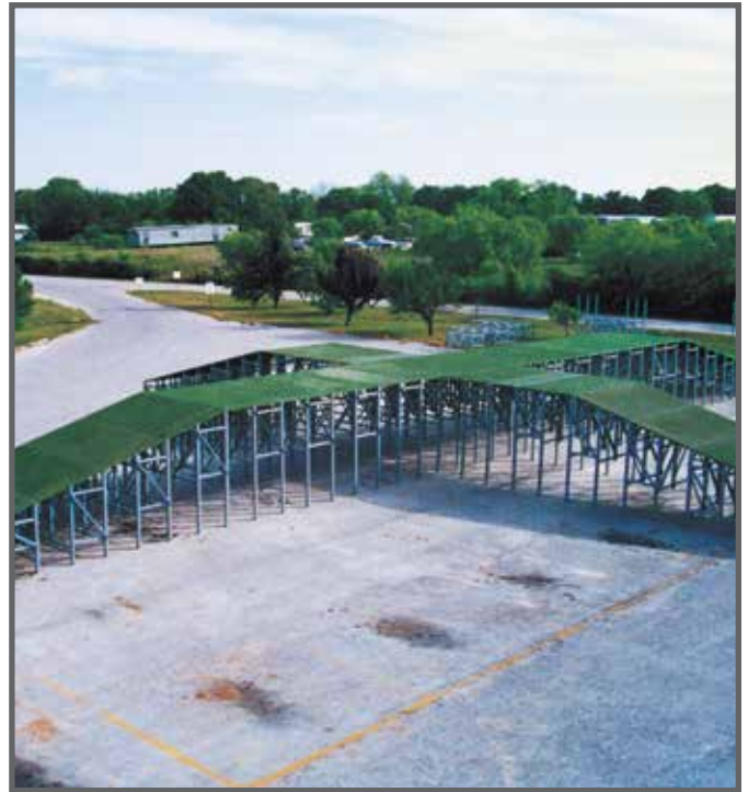
This all FRP (fiberglass reinforced plastic) structure was specifically designed for a General Dynamics anechoic testing chamber. FRP was required because its properties are transparent to the radio and electromagnetic waves used during aircraft testing.