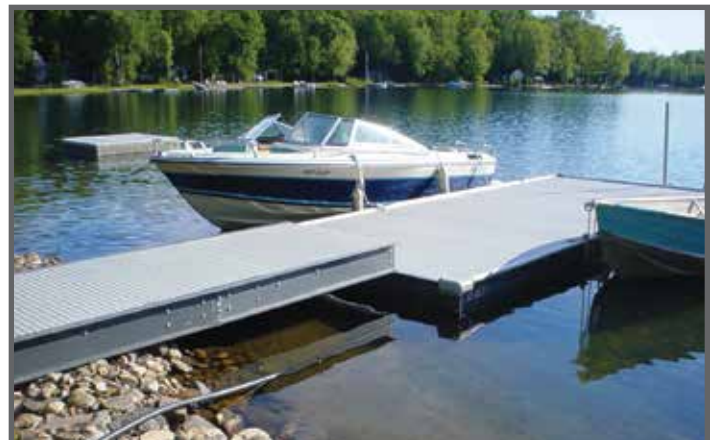
This all FRP dock was designed for a private lake front residence in Canada and utilized barefoot friendly, ADA compliant Aqua Grate® pultruded grating and Dynaform® support beams.