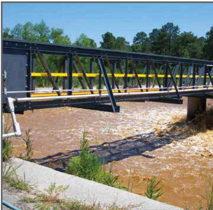
This all FRP truss walkway was designed and engineered to replace an existing rusted steel structure.