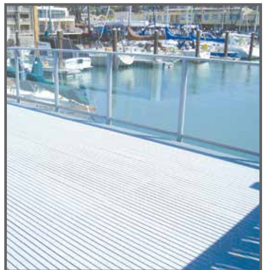
Fibergrate® FRP products replaced rotting wood at this yacht club. The new surface is corrosion and slip resistant plus barefoot friendly.