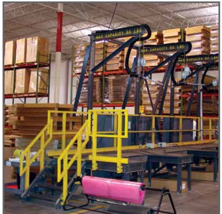
FRP products were chosen to upgrade these computer mainframe packaging platforms from wood.