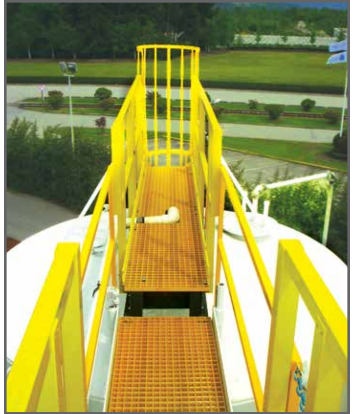
Fibergrate's grating, railings and structure create walkways for worker access to multiple tanks.

Let us demonstrate how our fifty years of experience, and the superior performance advantages of Fibergrate's FRP products, can create the solution to your unique problems!