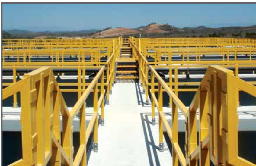
A partial view of miles of railing fabricated for a wastewater treatment facility in Mexico. This project also included several crossover platforms with stairways.

Other components, such as our Dynaform® structural shapes combined with Fibergrate® gratings provide an excellent alternative to wood and metal materials for use on docks, marinas, and other recreational areas. In addition, these products can be used for walkways and platforms in almost any type of facility.