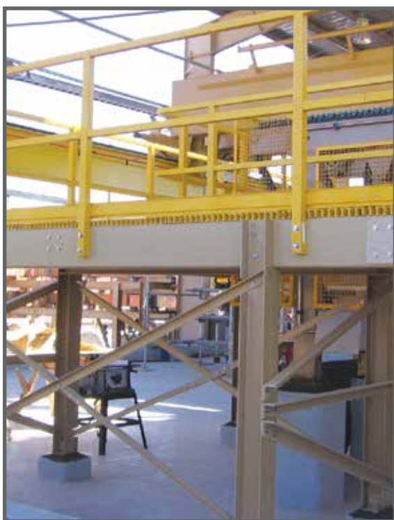
Fibergate structural shapes and pultruded grating were used in this mining facility for their corrosion resistance.