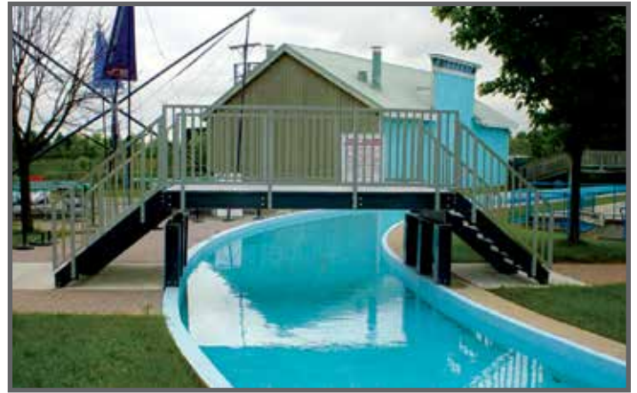
This bridge at a waterpark was constructed using Fibergate's railings, grating, stair treads and structural shapes. In addition to being ADA compliant and slip resistant, this grit-top surface is also barefoot friendly.