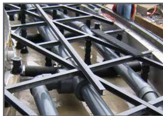
This fountain in Dallas required detailed fabrication of grating and structural components that could be submerged in water without corrosion or rust.