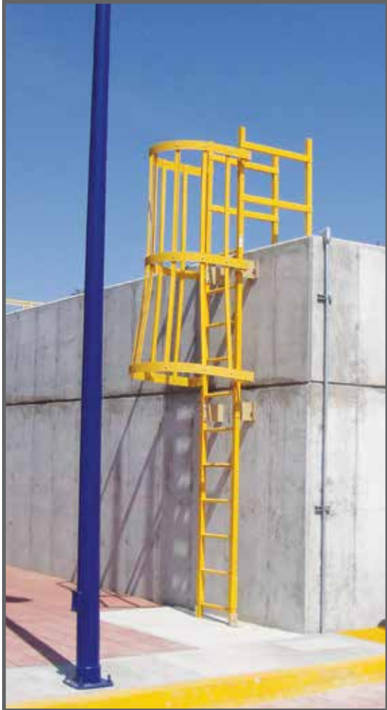
This Dynarail® caged ladder provides safe access for workers at this water treatment facility.

Since its inception in 1966, Fibergrate has continued to meet the growing worldwide demand for long-life, corrosion resistant fiberglass structural components. Fibergrate's FRP structural system components offer a superior strength-to-weight ratio compared to metals and resist the corrosive effects of harsh environments, especially those saturated with acids, caustics, and extreme humidity.